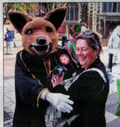
FOX ON THE RUN: Leicester Morris Men's fox with an admirer