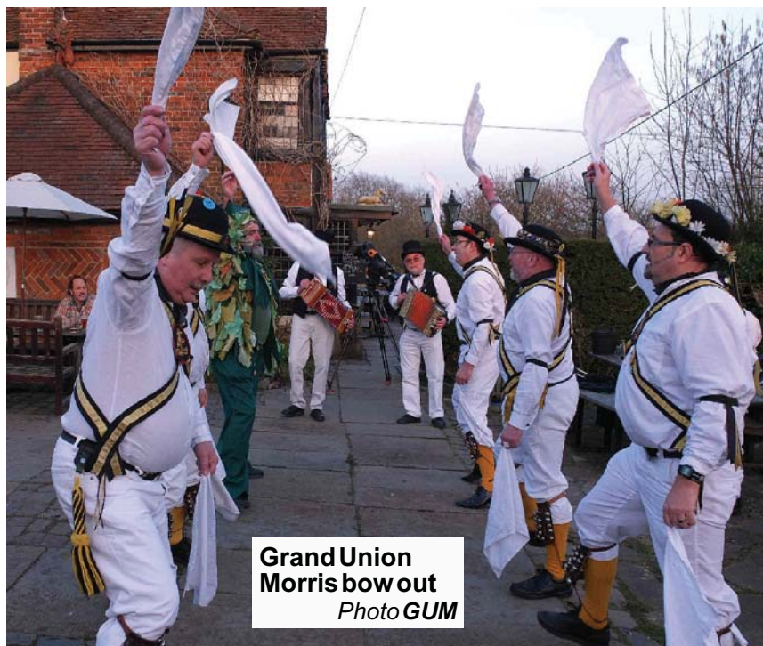
Grand Union Morris bow out

It's sad that after 40 years we have had to follow in the footsteps of so many Morris sides and indeed that of our patron side, Herga, who disbanded in 1990. We will continue to maintain our Facebook page and website ( www.grandunionmoris.org ) where our full 40 year history may be viewed. Keeping an online presence may result in a GUM revival, but with so many other male sides folding that seems rather unlikely.