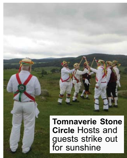
Tomnaverie Stone Circle Hosts and guests strike out for sunshine

The Banchory men are geographically based over a huge area of Aberdeenshire and think nothing of driving forty miles to practice. They took us to local beauty spots, the hilltop Tomnaverie Stone Circle, the Bridge of Feugh where the salmon leap the seemingly unscalable rocks, Queens View and Balmoral's Royal Lochnagar