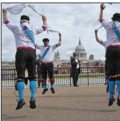
...and Taylor's Men dance for St Paul. Welcome to the Morris Ring!