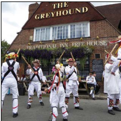
Leicester Morris Men perform at the Greyhound, Keston, on Sunday morning.