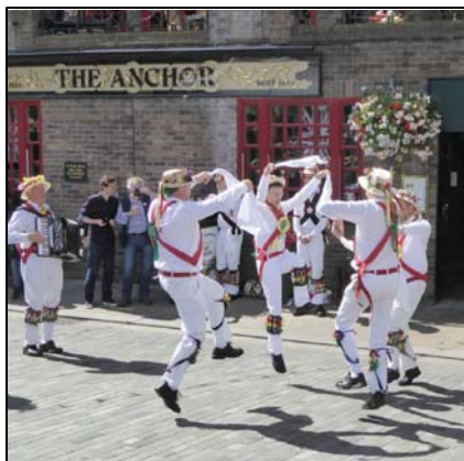
Bathampton Morris Men in the courtyard of the Anchor, Bankside.

To London they came: a hundred-plus Morris men astonished and delighted audiences at some of the capital city's most historic venues. At the Tower of London the sides were granted the rare privilege of dancing outside the great fortress.