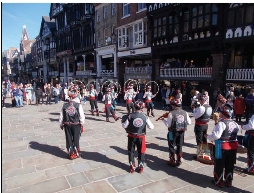
Chester City Morris Men perform The Miller at Chester Cross. The side's legwear, unusual amongst modern northwest teams, is based on that worn by the historic Middleton Morris Men.

Kinnerton Morris Men were guests of Chester City Morris Men to help them celebrate a well-attended and very sunny St George's Day in Chester earlier this year.