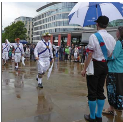
Jockey Morris Men at the Tower of London, venue for Saturday afternoon's massed show.