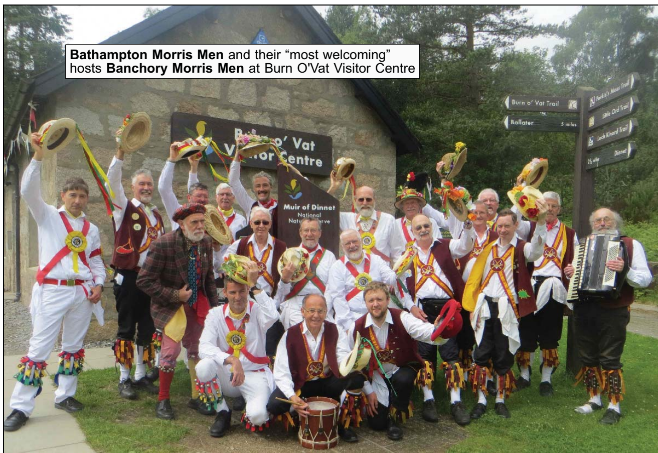
Bathampton Morris Men and their “most welcoming” hosts Banchory Morris Men at Burn O’Vat Visitor Centre