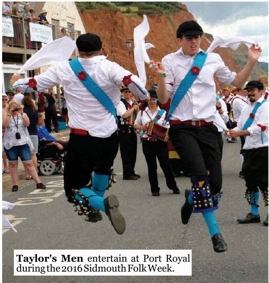
Taylor's Men entertain at Port Royal during the 2016 Sidmouth Folk Week.