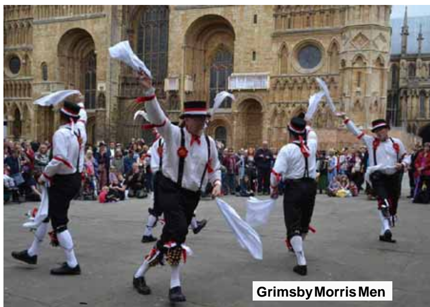
Grimsby Morris Men

Currently, the side performs two distinctly different styles of dancing although for special occasions we have performed both Molly and Longsword. Throughout the summer months it is the very sedate Cotswold tradition, which is danced with both handkerchiefs and sticks, to tunes played on a pipe and tabor. For this the side wear white shirts with red ribbons at the sleeve, black knee britches with braces, bell pads sporting red, white and black ribbons, top hats also bedecked with red, white and black ribbons and white hose. The 'Grimsby Boar', reflecting Grimsby's great boar hunting tradition, is the symbol of the side and their 'hobby boar' Stanley (named in honour of Stan Compton) is often seen reeking havoc among both young and old, whilst the side is dancing.