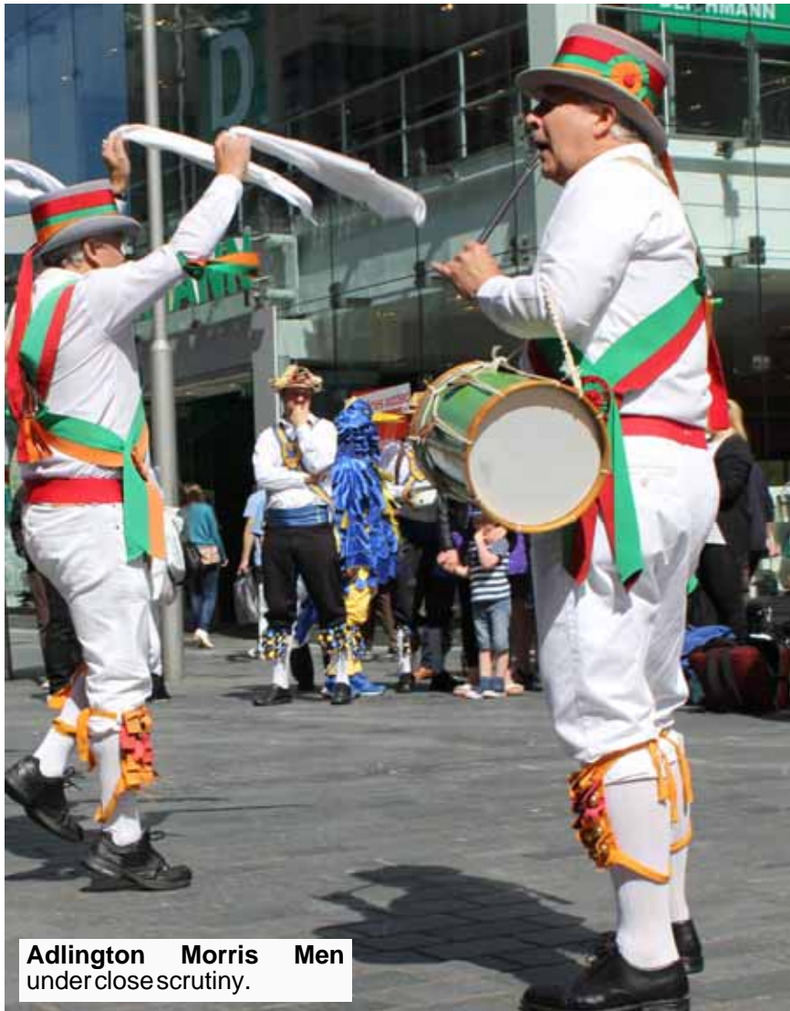
Adlington Morris Men under close scrutiny.

Images from the Liverpool Ring Meeting hosted in August by Mersey Morris Men