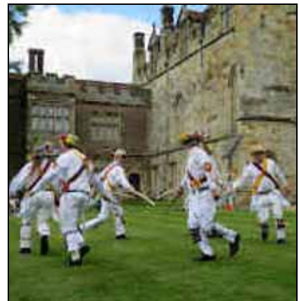
Perth Morris Men at Penshurst Place, Kent.