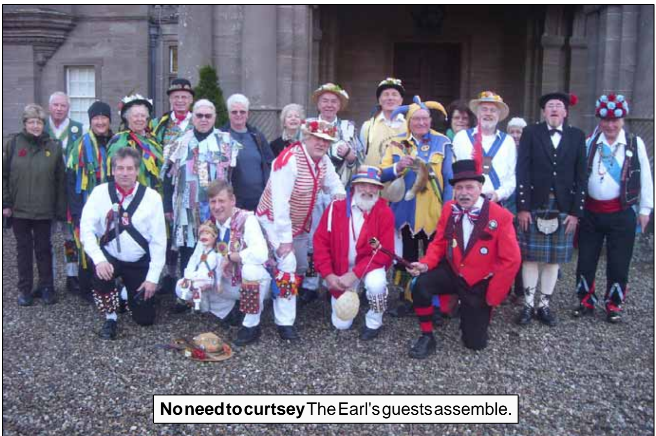
No need to curtsy The Earl's guests assemble.

To say that the venture was a success is a massive understatement. So successful in fact that I have organised and run return visits in all but one of the last 5