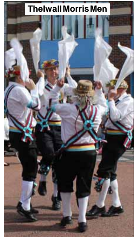
Thelwall Morris Men