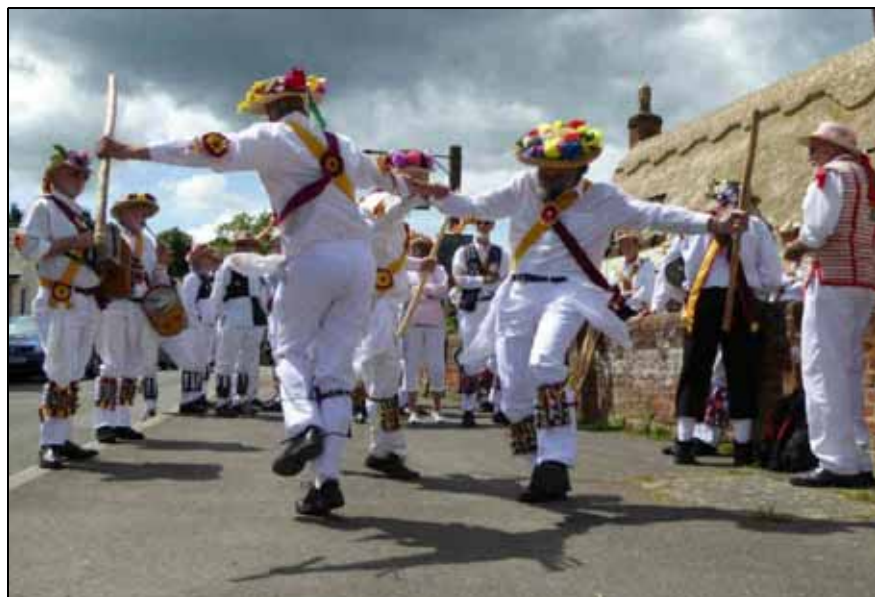
Perth Morris Men at the Thaxted Ring Meeting.