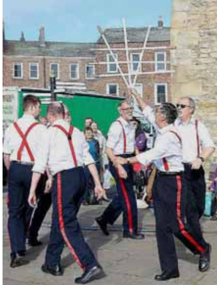
Redcar Sword Dancers at full tilt.

No one was more surprised than the team itself as our