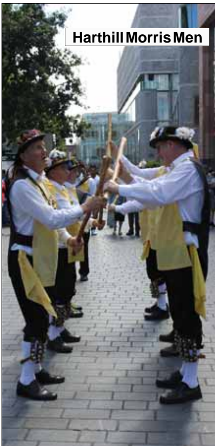
Harthill Morris Men