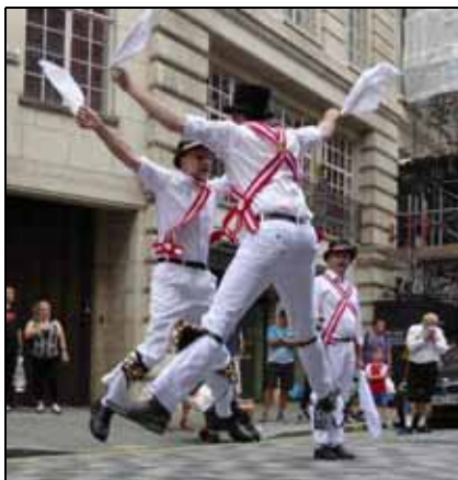
Adelaide Morris Men in Liverpool.