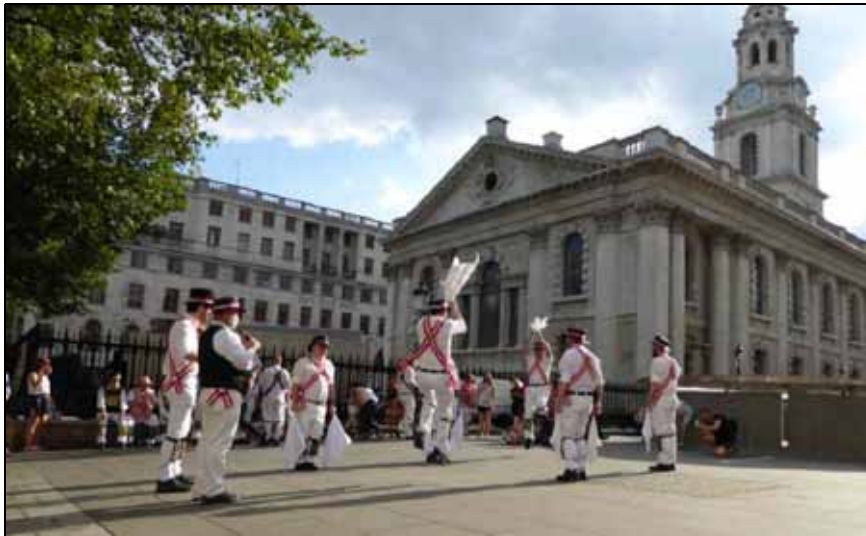
Adelaide Morris Men by St Martin-in-the-Fields, London.

Both of our Australian member sides, Adelaide Morris Men and Perth Morris Men , made the long haul last summer to perform in a variety of venues around the kingdom. Perth Morris Men were the first to arrive, in time to put in an appearance at the Thaxted Ring Meeting at the end of May, with Adelaide Morris Men landing later in the summer to attend the Mersey Ring Meeting in Liverpool in August. Both sides also joined other Morris groups up and down the land to enjoy home comforts and appreciative audiences.