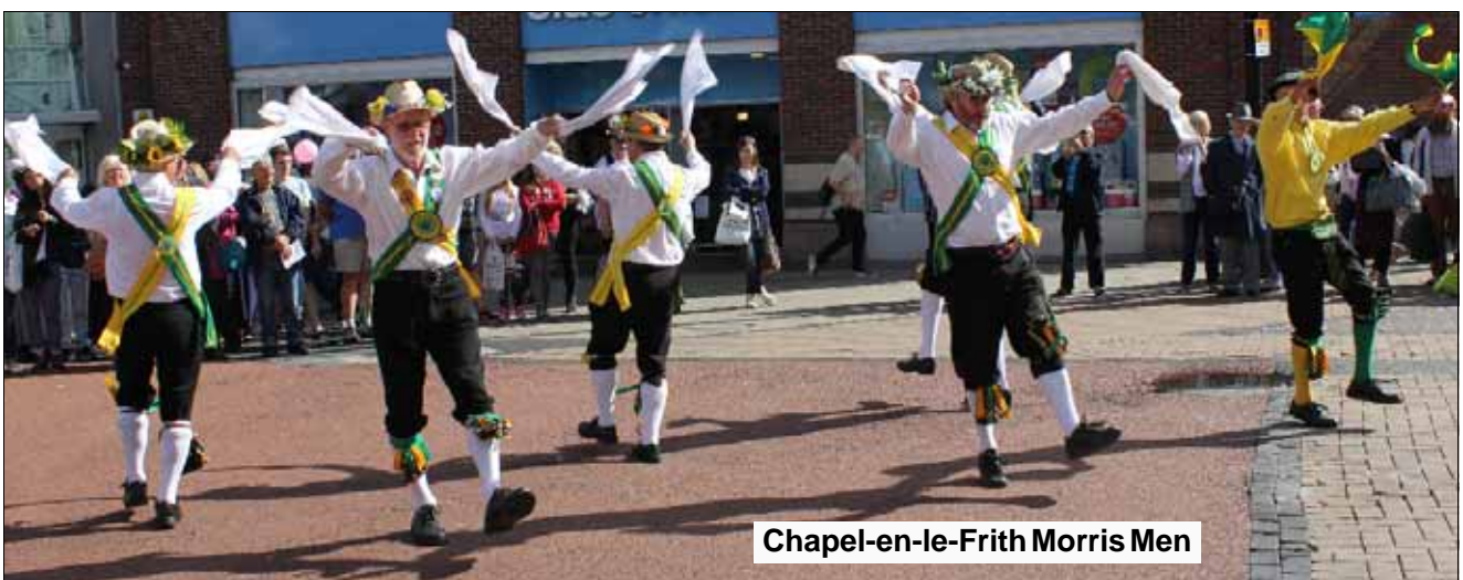
Chapel-en-le-Frith Morris Men