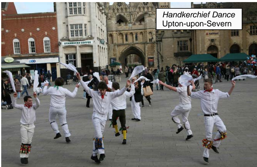
Handkerchief Dance Upton-upon-Severn