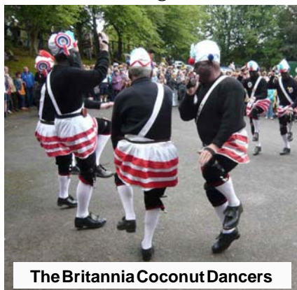
The Britannia Coconut Dancers

The day dawned clear and bright, and up on the moor, outside the long-closed Travellers Rest pub, I'm sure there was hoar frost on hip flasks as they were passed around. A "Nut" dance is followed by the processional, which goes at a fair old lick off down the A671, Rochdale to Bacup Road. Two teams take part, one on the left side of the road, the other on the right, and when one team is doing a "Nut" dance, the other is processing. Music is provided by the Stacksteads Silver Band, and as the day brightened and warmed up, the Nutters clattered along the road, diverting here and there