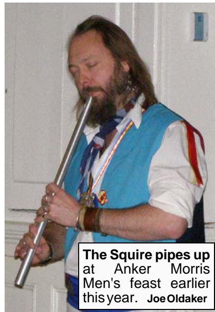
The Squire pipes up at Anker Morris Men's feast earlier this year.

At the time of writing, the last event I attended was the Helmond Ring Meeting; again another good weekend of fellowship and quality dancing. I must congratulate Shakespeare on their Bidford. They said they