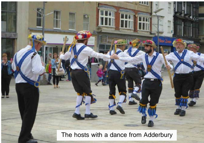
The hosts with a dance from Adderbury

We were pleased to be joined by full sides from the King's Morris, and Fenstanton Morris, and by morris men from Jockey, Letchworth, East Suffolk and Kemp's Men of Norwich.