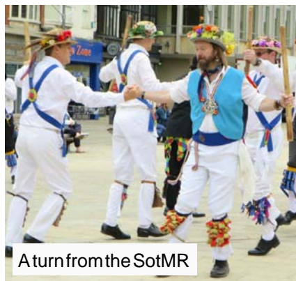
A turn from the SotMR

avoid the water fountains by dancing on the dry bits. However, the Young Men thought this a bit of a cop out and egged on by Roger in his fool's costume, much preferred the added piquancy of moving deftly between water columns. This performance encouraged even younger supporters to mimic Morris