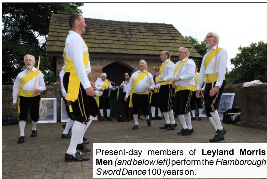
Present-day members of Leyland Morris Men (and below left) perform the Flamborough Sword Dance 100 years on.

We began the evening with a photo shoot at Leyland Cross (the logo we use on the backs of our waistcoats) before launching into our first public performance. “Concentrate on the dance: remember it’s Friday 13 th — and if