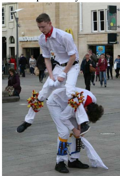
Up and over—but under thirty! Youthful feats in Peterborough

The distinct identity that sides in the Morris Ring have compared to the rest of the Morris community in the UK comes across strongly in the Morris Census data. Morris Ring sides are particularly male,