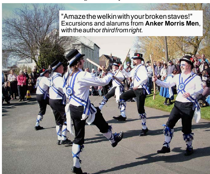
"Amaze the welkin with your broken staves!" Excursions and alarums from Anker Morris Men , with the author third from right .

Altogether a remarkable occasion—"We were there!"