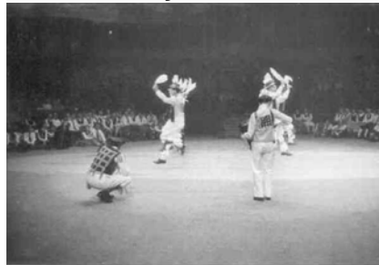
Westminster Morris Men perform in the mid-fifties at the English Folk Dance and Song Society National Gathering.