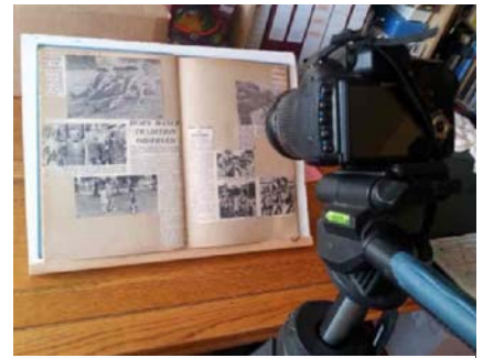
Camera and lectern both at 45°

Fill light is an amazing facility, which can reveal details of dark