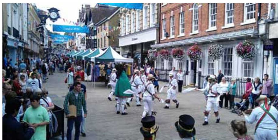
Top, Exeter Morris Men in the Square left, Long Man at the Alms Houses and above, Winchester Morris Men in The Buttercross, all in the City of Winchester

With the day scheduled, as I thought, with a feast in the evening,