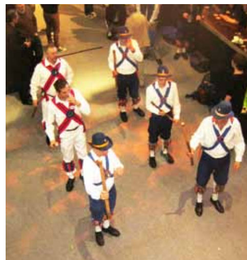
Photos: page 13, Bedford at the Beer Festival, Page 14 left, East Surrey , middle, massed dance in Harpur Square, and right, bottom, Manchester close by; This page-above, top left, clockwise, Bedford, Anker, Bedford with 2 Crosse's, and Massed Dance