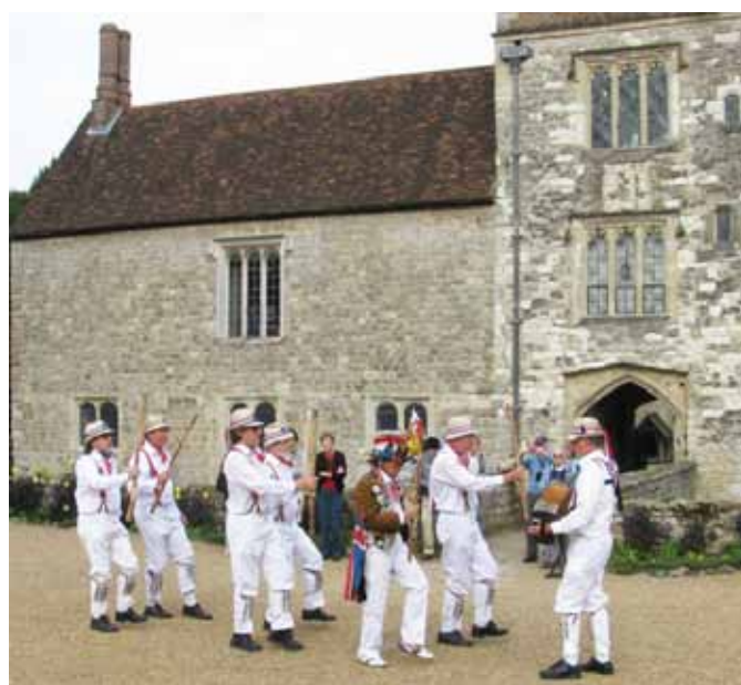
Hartley Morris Men dancing at Ightham Mote during their hosted Morris Ring Meeting

was a singing booking on the sailing barge Edith May moored at Rochester Pier. It was a cold blustery day but we spent several comfortable hours singing in the bowels of the ship with real ale, a warm stove and good company to hand. In addition to our weekly Thursday evening tours, the next big event was our annual weekend Ale on 8 th - 10 June