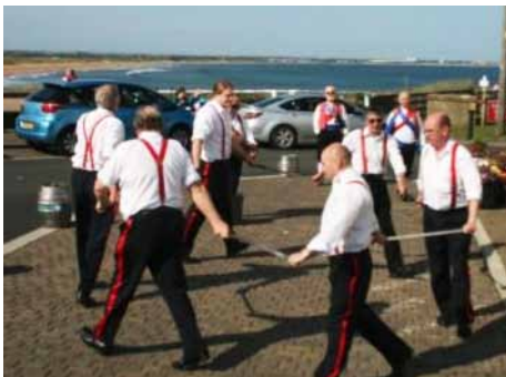
Redcar Sword above and Saddleworth below at the King's Arms, Seaton Sluice

plus side this left a bit of time for sun bathing and refreshments.