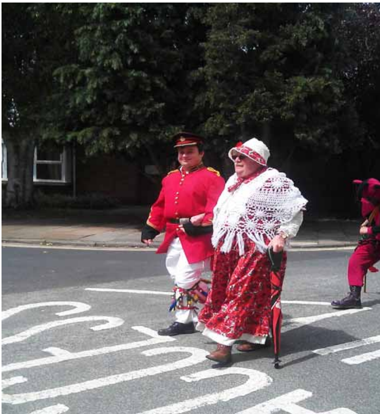
The Winster King and Queen

successive generations the horns have remained in the possession of the Abingdon Traditional Morris Dancers. The mayor's cup, it is said, to have been made from a club used in the melee. The sword is reputed to be an 1805 naval officer's sword.