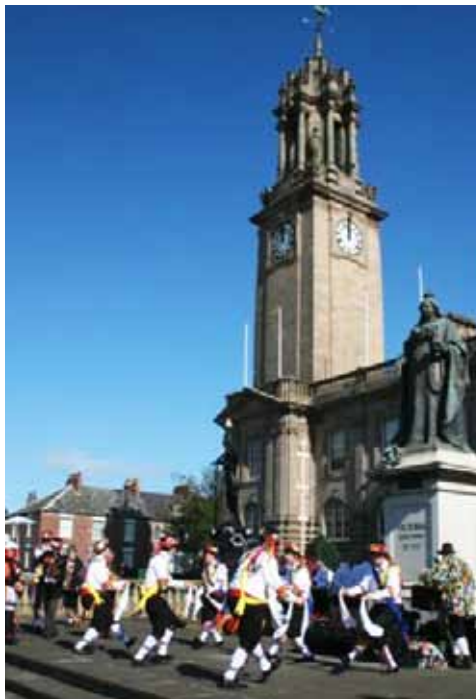
Moulton Morris Men dancing at South Shields

The large numbers of dancers unfortunately meant that dancing was restricted to a couple of dances per side per dance spot but on the