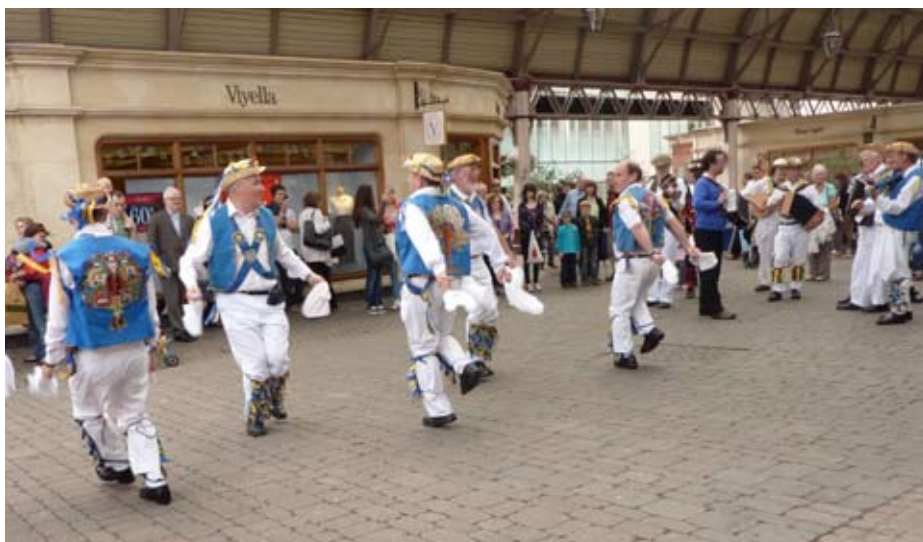
Thames Valley in Windsor Royal Shopping Centre and below, the evening sun shines on Taeppa's Tump Northwest Morris on Datchet Green.

sides' massed melodeons emerged undaunted.