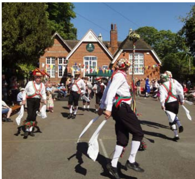
Photos, left South Stoke May Fayre

help the day along. As usual we went down well with the public. Over the four days of the holidays,