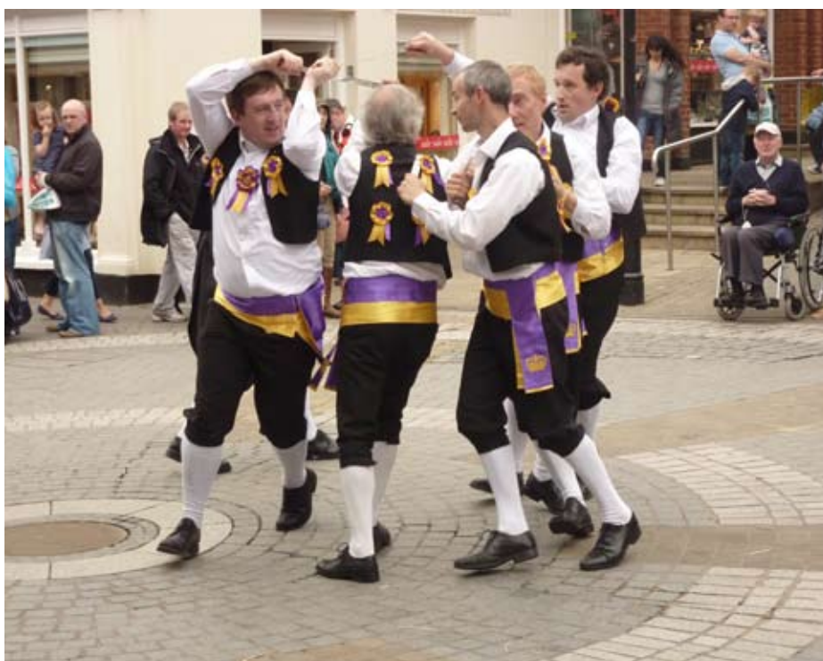
Hoddesdon Crownsmen rapping in Peascod Street, Windsor and below, Off-Spring dance beneath the Windsor Wheel.

No-one who dances in Windsor need ever go unobserved and unphotographed, such is the density of tourists. But as the collectors found, it is more difficult to extract from the onlookers coins and notes bearing the head of she who lives at the local castle. One explanation is that the tourists, ferried in by the chara-load, are so well provided for by their tour operators that they need not carry local currency. Or perhaps what is needed is the babel-fish ability to collect in any known language.