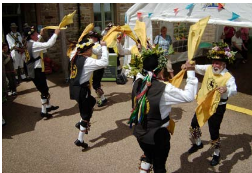
Harthill at the Wortley Arms and below, Wath, in a fine line