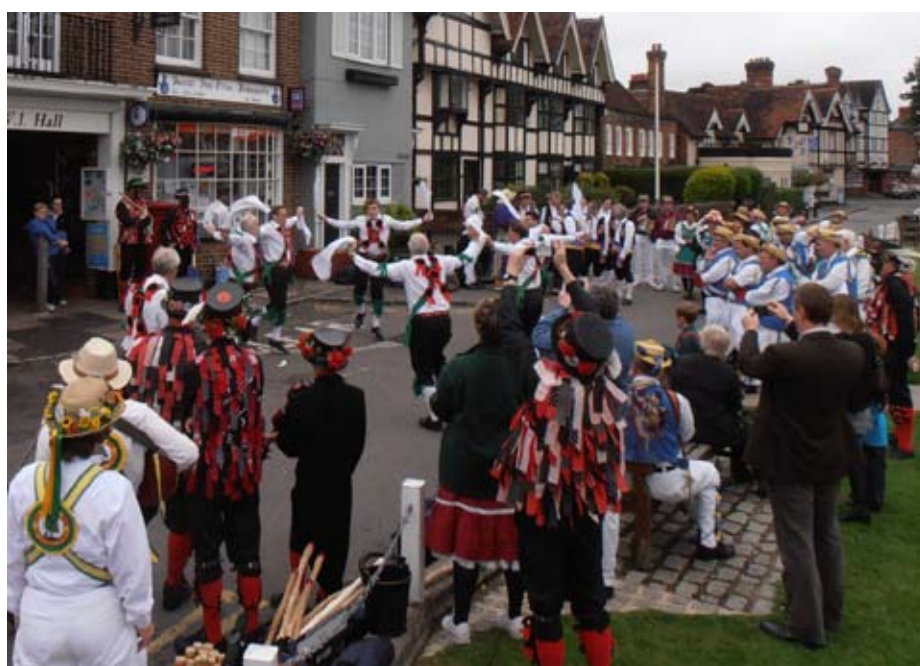
Greensleeves dance The Rose, Fieldtown in the morning's massed show.