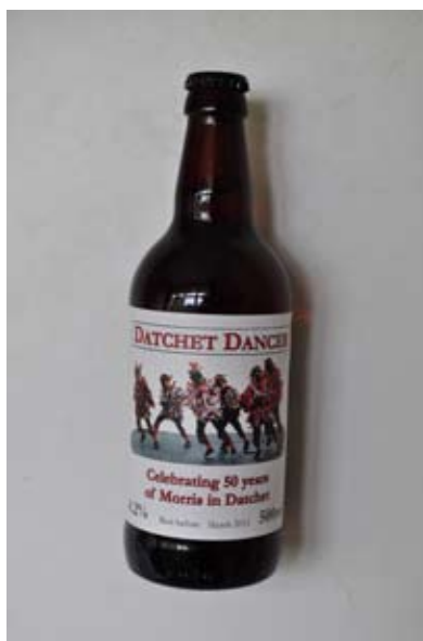
Datchet Dancer's celebration ale.

A fiftieth birthday is a good time for making resolutions. For Datchet Border Morris, these included holding the club's first day of dance for some years, and making a CD. Now the club's base in the village of Datchet has much going for it, including a half-hourly train service to Waterloo. It boasts a commodious and friendly WI Hall where the side has practised for most of its fifty years. And just 50 yards away is the estimable Royal Stag public house. Dancing on Datchet Green can command an audience numbering several hundred on Boxing Day. But having just this one viable dancing site did restrict the possibilities for a day of dance. And being directly beneath a flight path into nearby Heathrow did limit the duration of recording takes to the intervals between aircraft landing, which can be under two minutes. Patience and perseverance overcame the aircraft noise issue