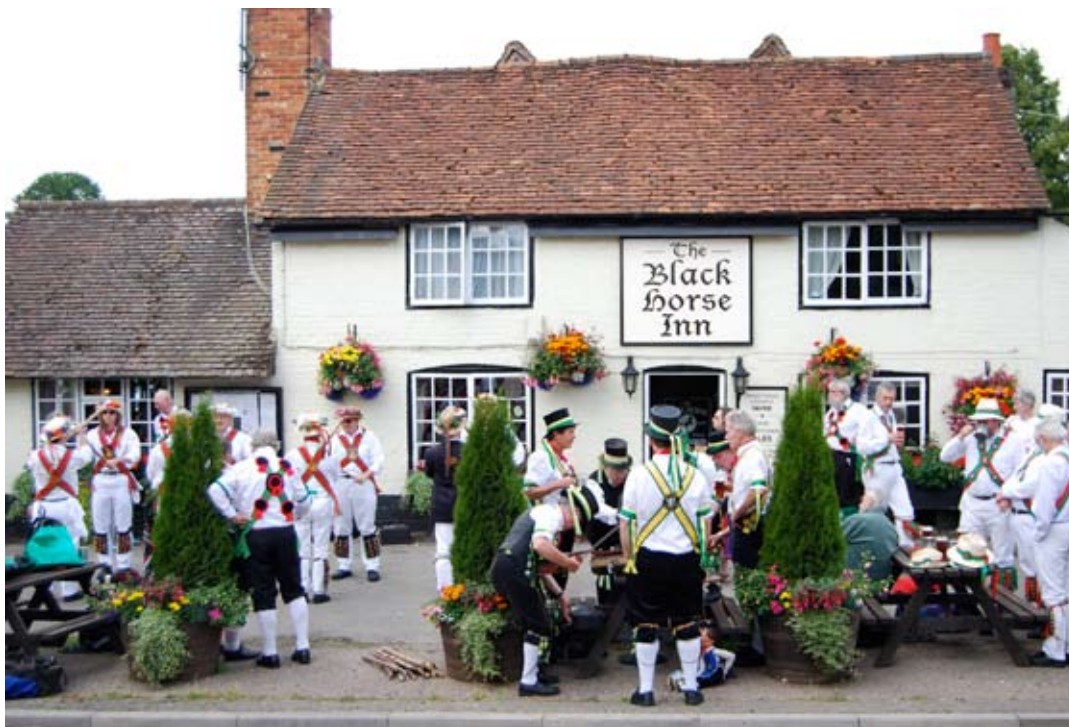
Dolphin Morris Men dancing at the Black Horse Inn, Chesham Vale, during Greensleeves Morris Men hosted Ring Meeting, with Long Man Morris Men and Winchester Morris Men. More in next edition