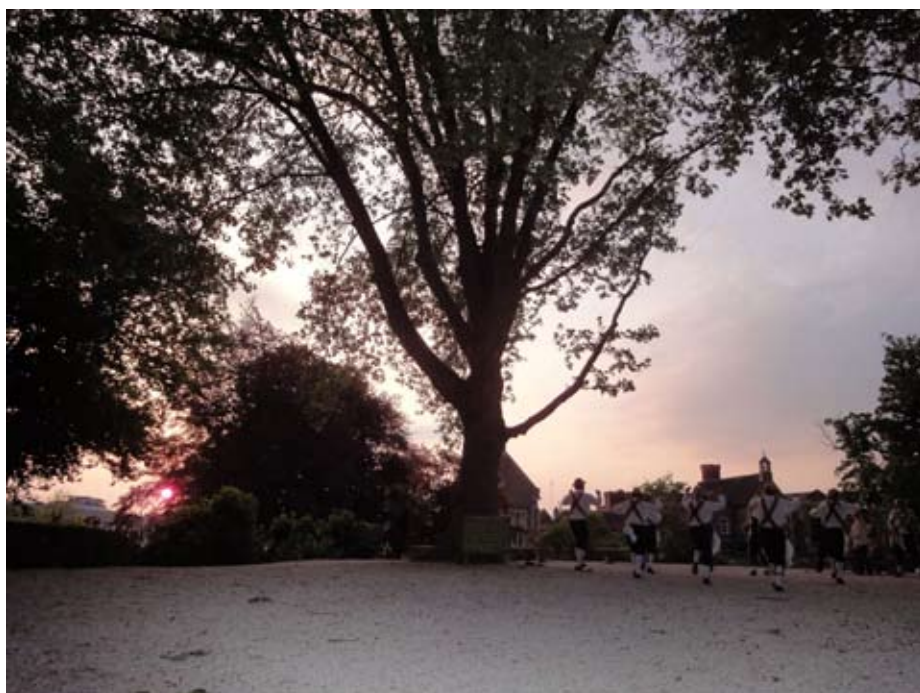
The Castle Mound, May Morning as the sun rises over Reading Jail

16 KMM sang the Reading Carol “Summer is a comin' in, loudly sing Cuckoo” (first recorded in 1513, but not on vinyl!). There followed some enthusiastic and joyful dancing; at least as good as would follow a beer festival; an uncomfortable