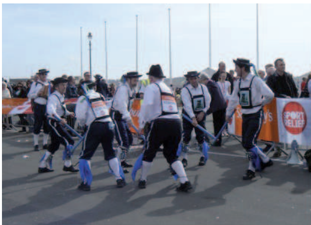
Plymouth showing their paces on the Hoe and below, with their 'medals'; both photos, Plymouth Morris Men

So far, as a team, we have raised £939.22 in