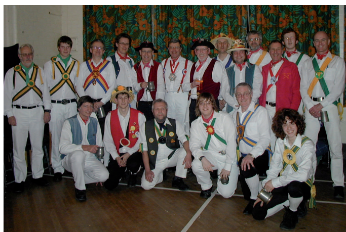
The First Timers at the Jigs Instructional, and below the Officers at the Feast, Thaxted