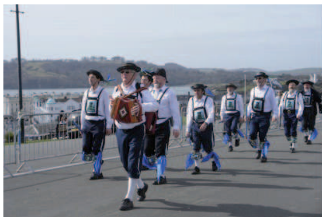
Plymouth on the Hoe: Winsters Processional

Once out on the road we quickly came upon a young Policewoman on traffic duty, helping to enforce the local road closures. 'Rose Tree', Bampton, was unavoidable and the