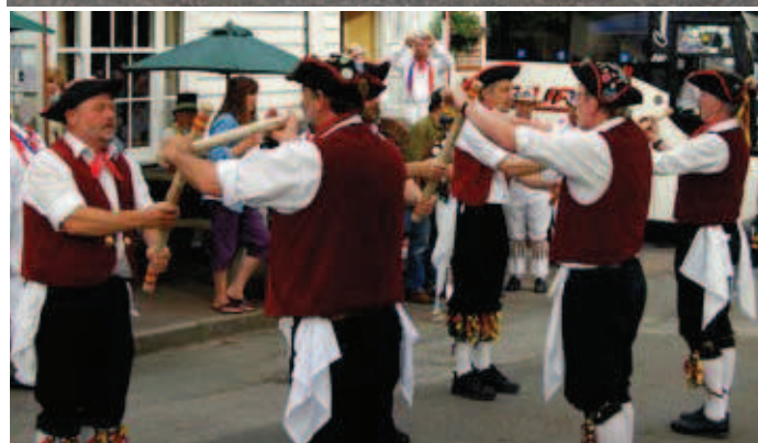
Top left the Goacher's Tour; top right massed display at Sissinghurst Castle; left, above and below left; The Pride of all Hampshire in Winchester Morris Men, Yateley Morris Men and Victory Morris Men respectively; right, Lincoln and Micklebarrow jig; and the hosts Hartley performing at Ightham Moat