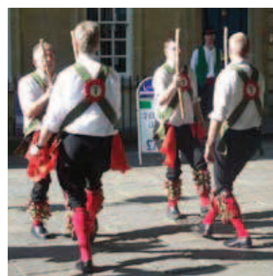
Above, Helmond Morris Men