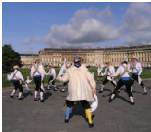
Trigg Morris Men, far right; below, Ravensbourne enjoying ice cream and Mersey right