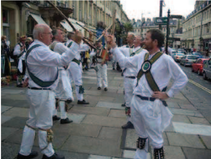
White Horse Morris Men