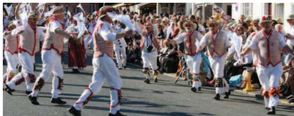
Photos: 1. above, two processions meet in Thaxted; 2. above left, Britannia Coconut Dancers in Thaxted; 3. left: Thaxted Morris Men and 4. below, Saddleworth

Full contents list on page 5, after The Squire of The Morris Ring's report on pages 4-5.