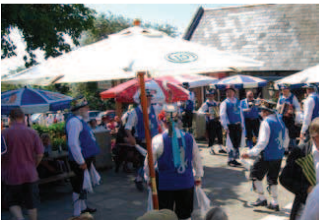
Left: the Hosts, Men of Wight; Right, and below: Rutland;