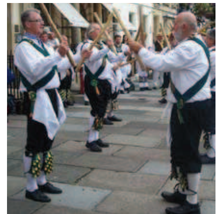
Right, Chanctonbury Ring Morris Men,