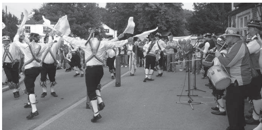
YateleyMM at Dog and Partridge, above and a special entertainment from Yateley MM was the "Dance of the Fat Santas" (below) and which can be seen on Youtube: http://www.youtube.com/watch?v=ggwDkgJc4sY&feature=related