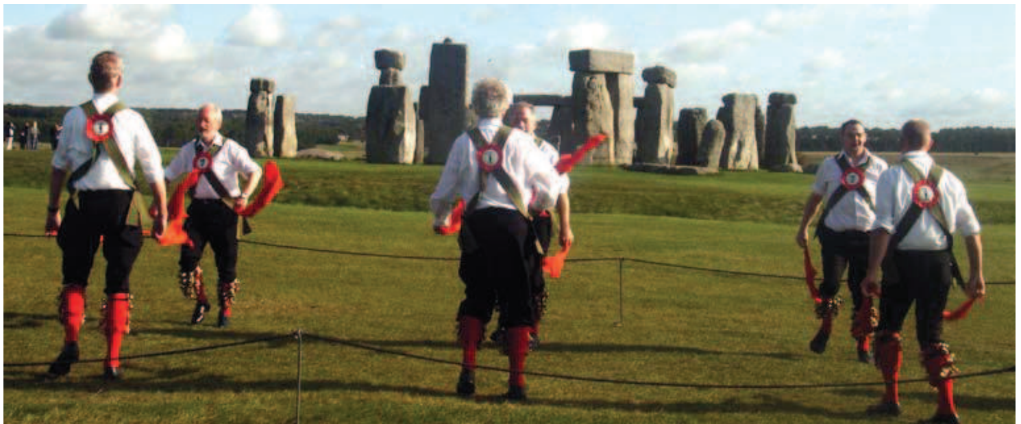
Above, Helmond Morris Men at Stonehenge, on route to Bathampton