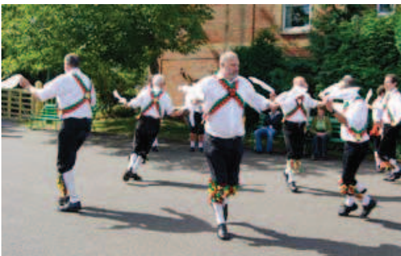
Top-West Somerset, Bristol Above: Dartington, Rutland Left: Colchester Right: King John's