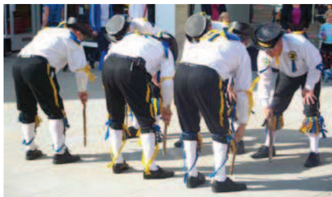
Top left, Gloucester Morris Men; Ravensbourne Morris Men above below, Mersey Morris