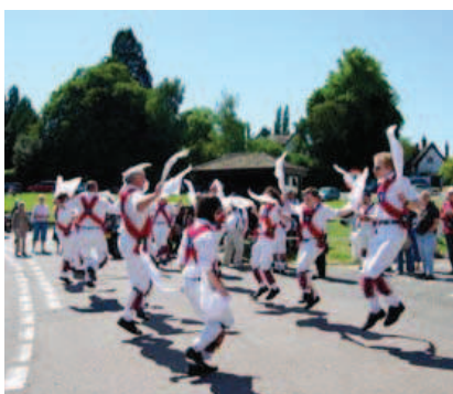
Left: Chalice; Winster below (GJ) & below right, Westminster (GJ)