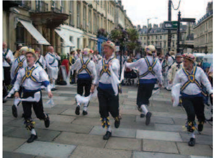
Mersey Morris Men