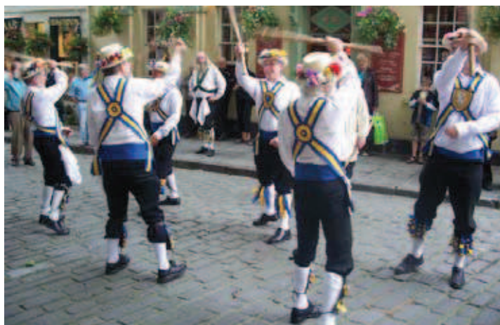
Above, Mersey, below left the Host side, Bathampton Morris Men and group photo below