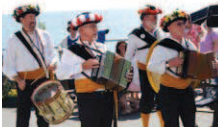
Clockwise, from top left: West Somerset, Colchester, Bristol, King John's, Men of Wight, massed display at Sandown, Men of Wight on Bramble Bank, King John's musicians, Martlet & Dartington.