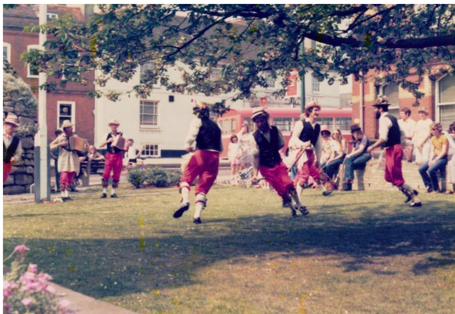
Farnborough Morris at Alton 8 May 1976

There are more than twenty distinct dances in the Farnborough Morris and if you have enjoyed watching those that you have seen we feel that all our effort and trouble will have been well rewarded. We hope that you have had a piece of the Lucky Morris Cake, a remedy for all ills and troubles. If you are puzzled by the absence of a collecting box this is because we dance for our enjoyment and our expenses are not unduly heavy.