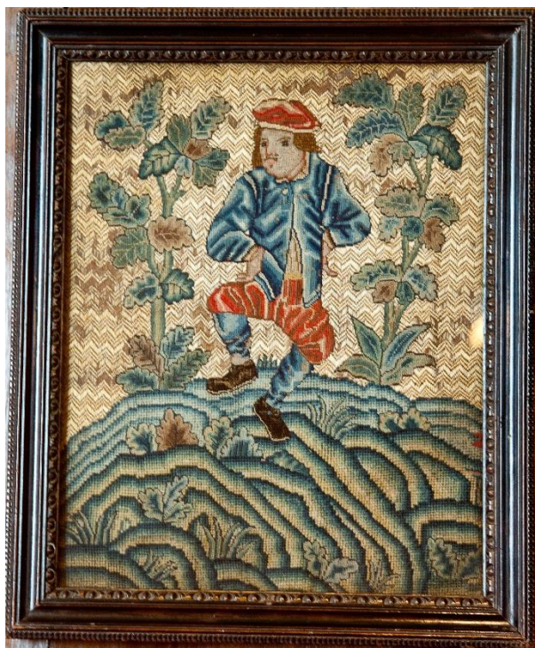
'The Morris Dancer' at Sulgrave Manor

There is no postcard available but it does appear with commentary in Overson, Jenny, Textiles at Sulgrave , (Sulgrave Manor Publication, ISBN 0 851013716, 2002), p. 5, available from the Manor shop or sulgrave-manor@talk21.com ). The photograph below appears with the permission of Sulgrave Manor Trust.