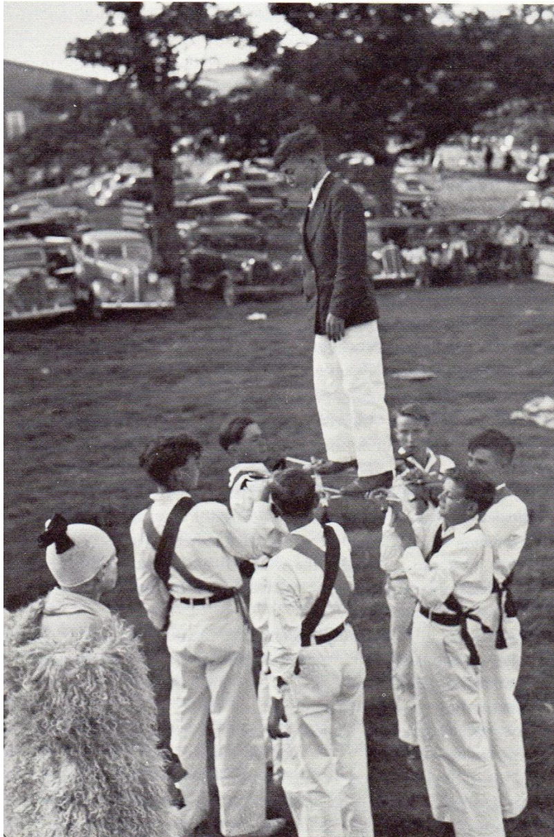
Pine Mountain Settlement School sword dance team at the White top Folk Festival 1935.