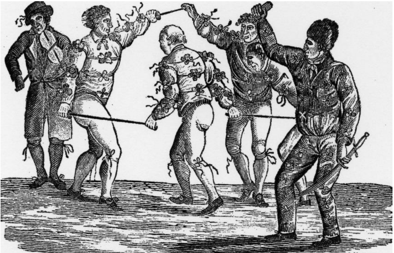
The 'Pitmen sword dancing' print