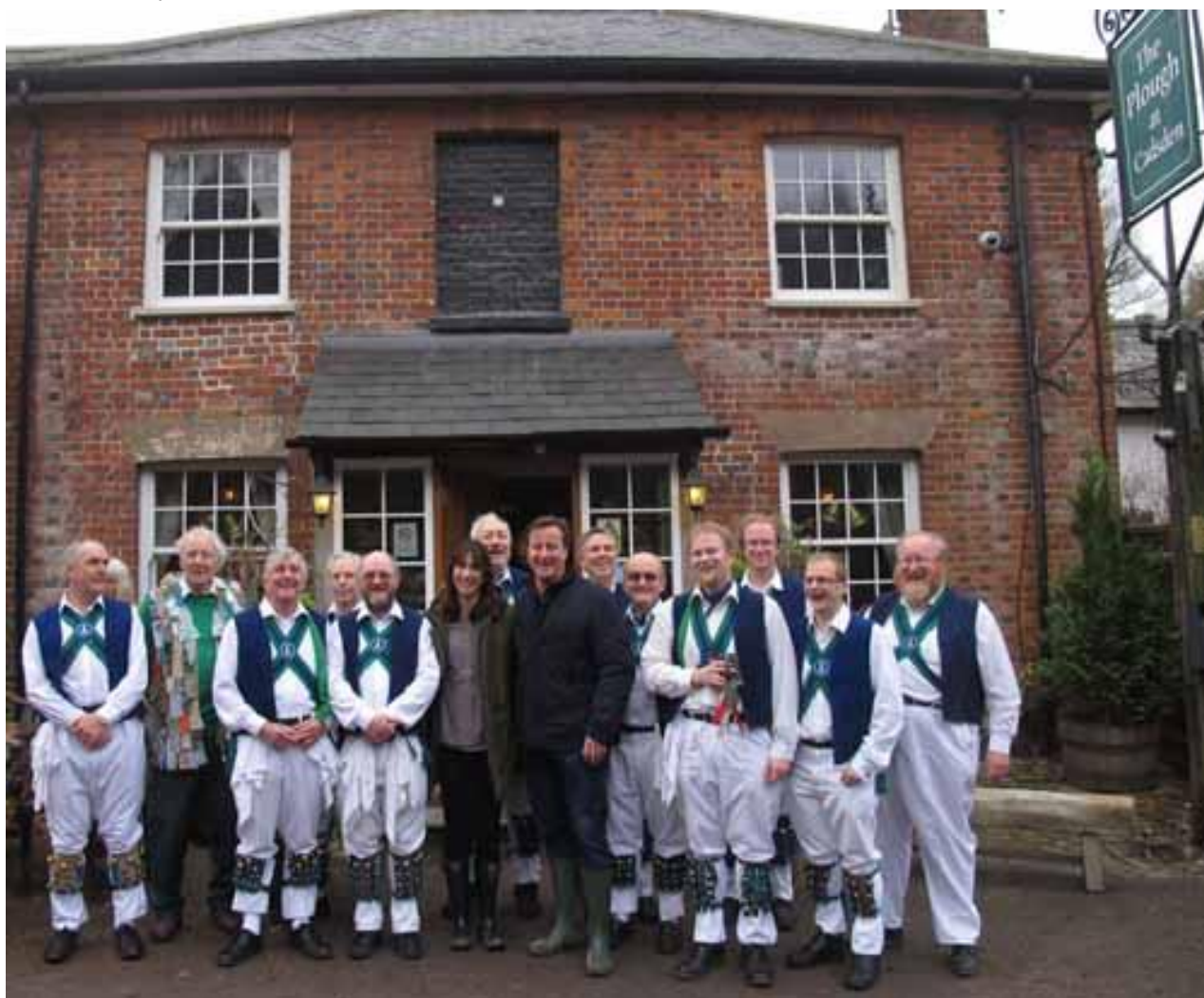
Whitchurch Morris Men outside the Plough at Cadsden with David and Samantha Cameron - Boxing Day 2011